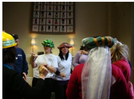
Having a laugh during Joyworks workshop

Watching comedy can also have a therapeutic effect.